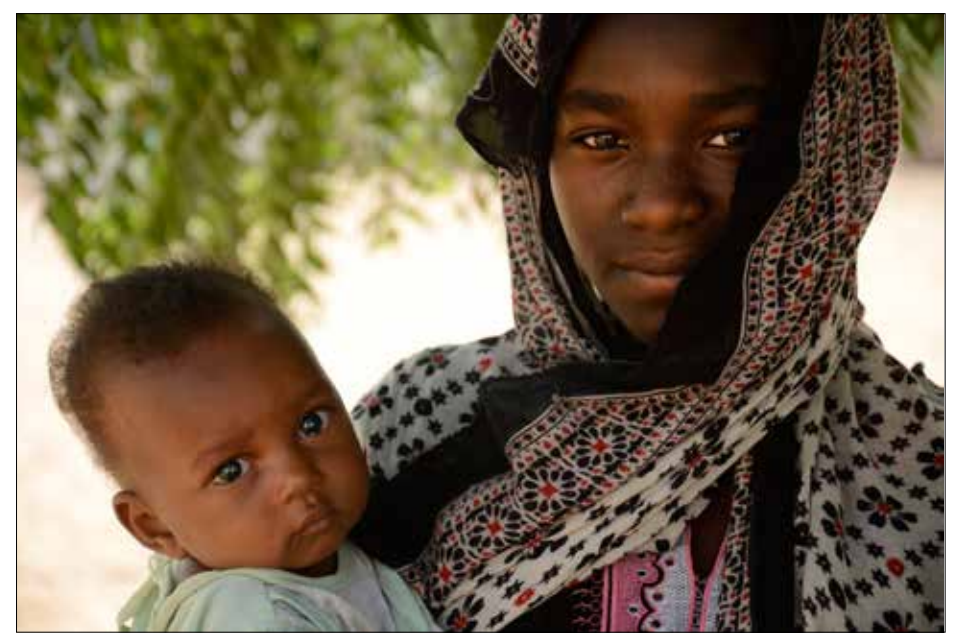
JRS works to ensure women with children have access to school.

their children. And, on the other hand, individuals are discouraged about completing their education when there are no opportunities for employment.