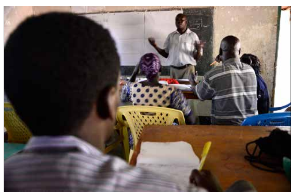
An adult education class for refugees in Kenya's Kakuma camp.

forced to work informally and, in some cases, submit to exploitative labor conditions in order to survive.