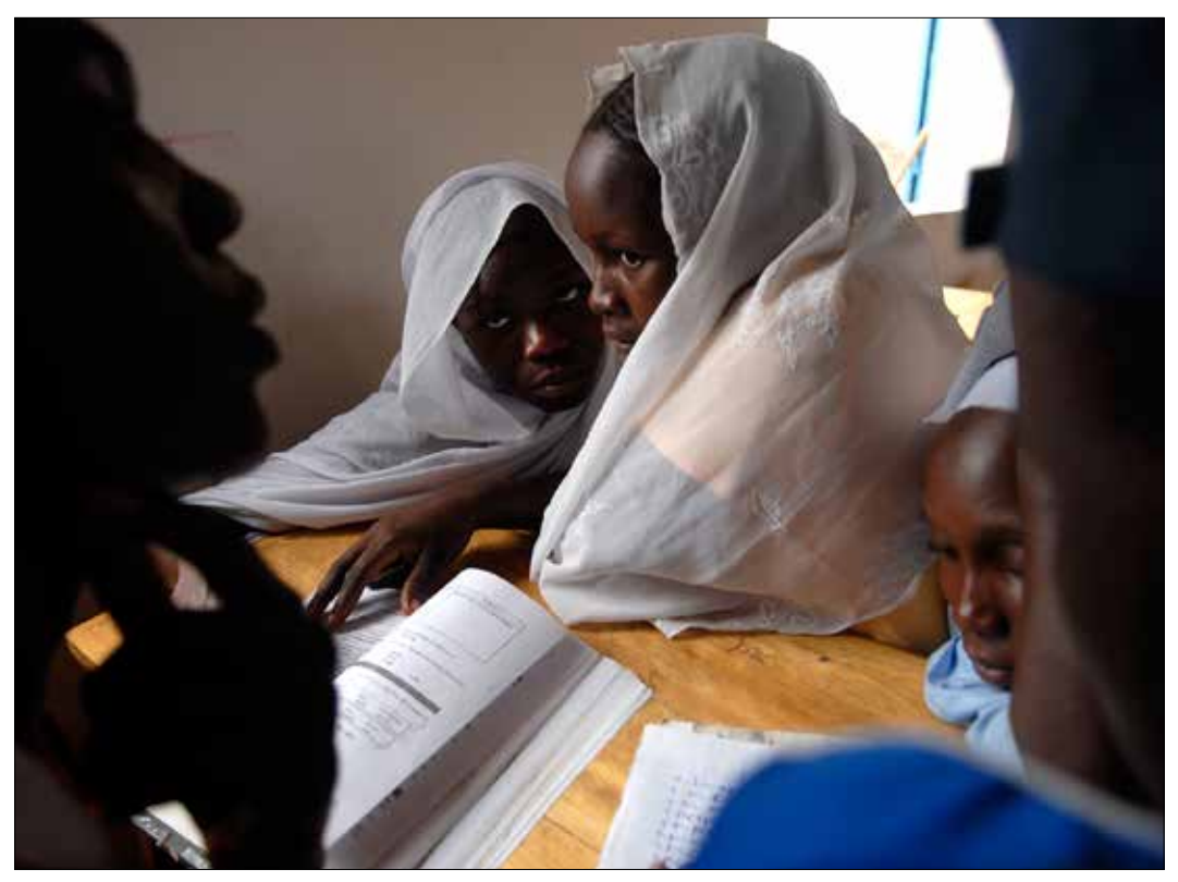
Students share a text book in Chad's Djabal refugee camp.

refugee status, expenses are not covered. This includes fees for tuition, school uniforms, books and transportation which are impediments to their education. In Kenya, lack of host country recognition of student qualifications from their home countries poses another barrier to access. In Uganda, while there are no real restrictions for displaced students to enter school and refugees are able to work and contribute financially to education-related costs, JRS staff report that school credits from refugee home countries are rarely recognized.